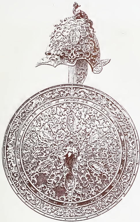
SHIELD AND HELMET ASCRIBED TO CELLINI. Palazzo del Bargello, Florence.